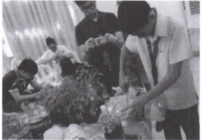
October 2016 Ma. Guerrero Elem. School Manila