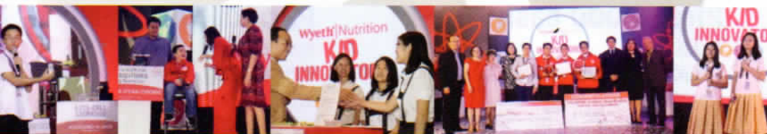
The Grand Winners of the past seasons of the Search for the Wyeth Nutrition Kid Innovators