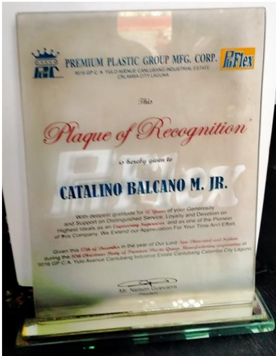
Plaque 8 inches (rectangular) Glass and engraved with box